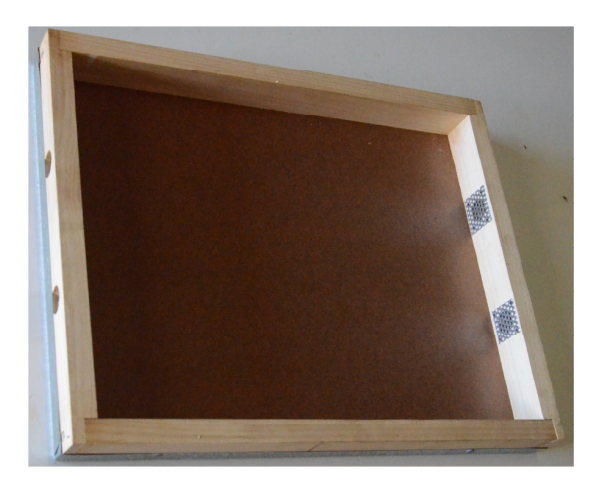
^ When finished it should look like this

*** Instructions reprinted from their "How To" pamphlet with acknowledgments and kind permission of John L Guilfoyle Pty Ltd. ***